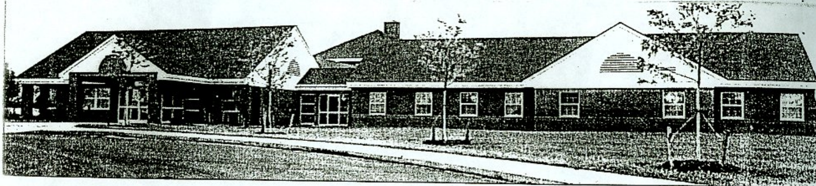
The Hillside Children's Center is a private non-profit facility overseen by state Department of Mental Health.